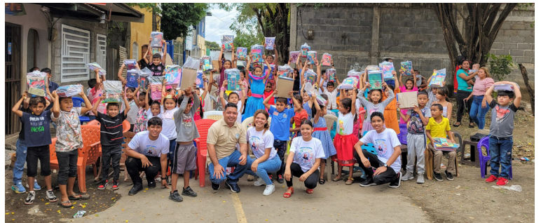
School supply packages for children in the Los Martínez Sector D Barrio

Costs for the program come from our general operating budget which is funded by non-earmarked donations. This year program expenditures totaled US$ of 10,319.83 (approximately $50 CND per participating child).