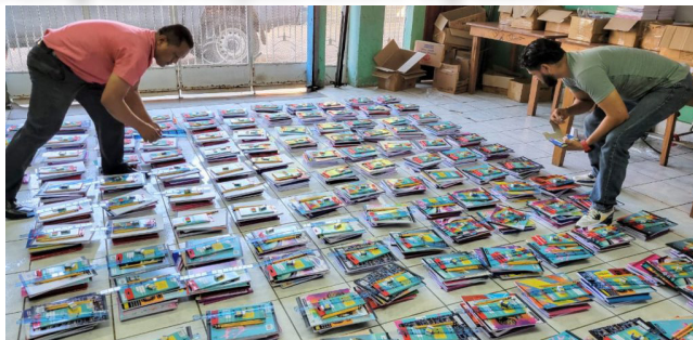
Preparation of school packages