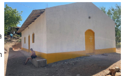
Outside Painting Complete