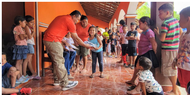
La Honda Community School receiving their school packages

The Backpack Project in Nicaragua, a collaboration between the Roots of Change Foundation and FUNDACCO, achieved significant milestones this year. Our original goal was to provide essential school materials directly to students in El Rodeito and El Nancital schools. However, the project evolved to encompass five schools in four different communities.