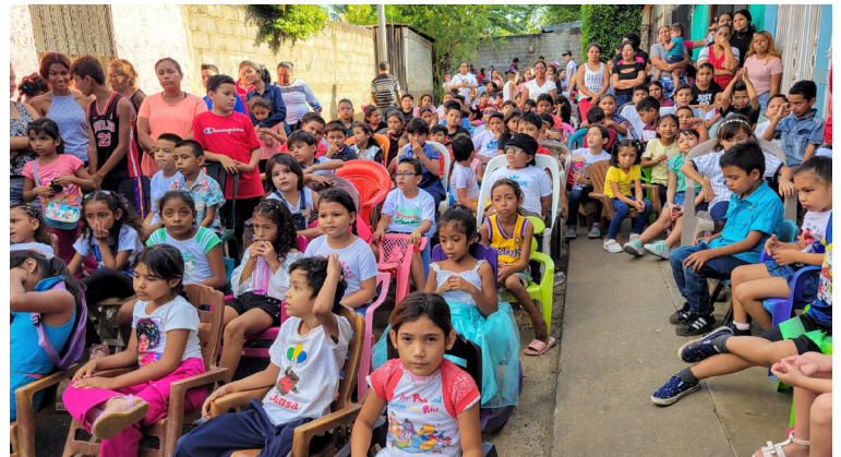
Children of the Edgard Lang Barrio

Starting in the spring, FUNDACCO spends a great deal of time and effort training the youth volunteers to facilitate the learning activities prior to the start of the program. The commitment of the volunteer youth group plays a large part in the success of the program. Cont'd on page 4