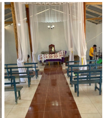
Interior of Community Centre