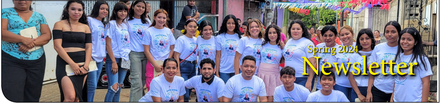
2024 Volunteer facilitators for the Youth and Children Education and Development Program

Roots of Change Foundation Source de développement 19 Years of bringing hope to people in need