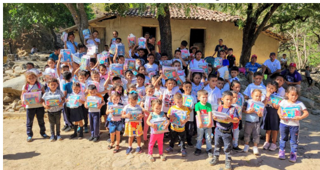
Las Lajitas School Students